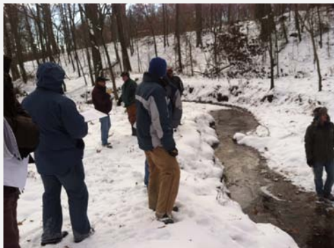
Conservation Planning Training - NRCS