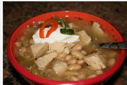
Southwestern White Chicken Chili