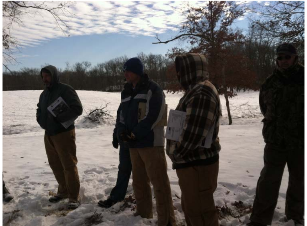
NRCS Area Meeting, December 2013

The next TTK Advisory Committee meeting will be Tuesday, March 11th at 6:30 pm. Meetings are held at the Hoosier Energy Environmental Education Center, south of the Turtle Creek Reservoir.