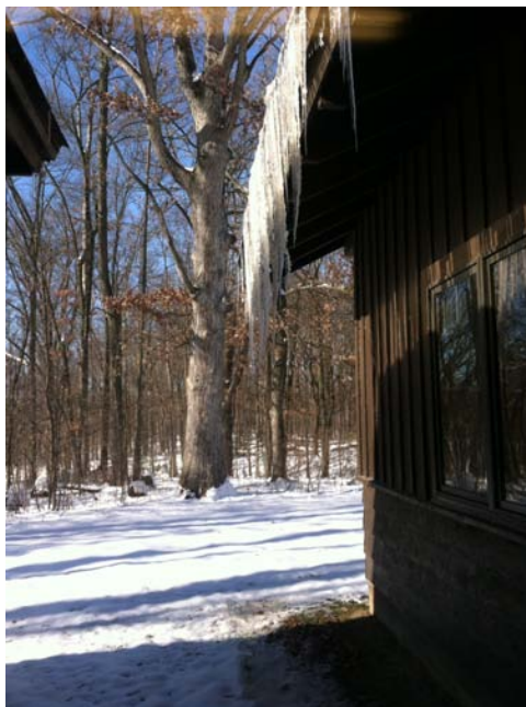
Winter in the watershed

In addition, they have also completed projects for various other conservation