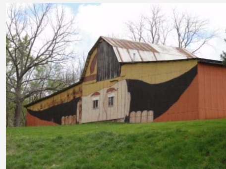
Curious onlooker found in the TTK watershed