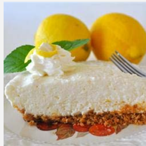
Lemon Icebox Pie

To reiterate, that means we are able to make many important decisions regarding the utilization of grant funds locally . Therefore, the guidance of stakeholders, landowners, and other interested parties is vital to the success of this grant. If you would like to learn more, please contact us! We encourage your participation and are eager to hear your opinions about the natural resources in our watershed!