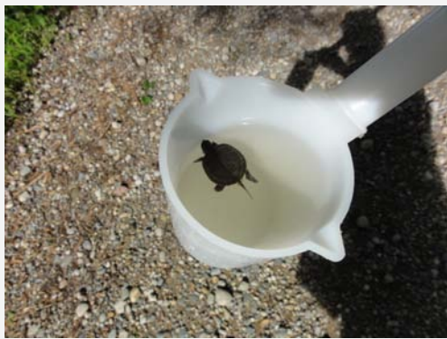
Tiny turtle found in Kelley Bayou watershed