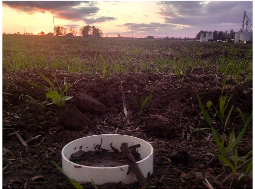
Pictured Above: Soil infiltration test conducted in M.Bell's cover crop field

Cost-Share Program information available: http://watershed-alliance.org/index.php/ttk-cost-share-program-guidelines/